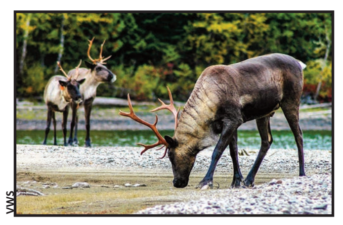
VWS's three Inland Rainforest proposals were designed with the preservation of wide-ranging and old growth-dependent species in mind. The Quesnel Lake Wilderness would protect habitat for a population of about 500 Deep Snow Caribou. Despite declining caribou in the other two park proposals, they contain nearly 200 other known species at risk.

Highly troubling is that the ancient, intact remnants of the rare Inland Temperate Rainforest ecosystem are mostly unprotected (and the only recent protection was a small part of the Robson Valley). Our Quesnel Lake Wilderness, Rainbow-Jordan Wilderness and Selkirk Mountain Caribou Park proposals represent three major biodiversity hotspots. All three must be protected to see the most biodiverse remnants of this globally rare ecosystem persist into the future. More information on the proposals can be found at www.vws.org/action.