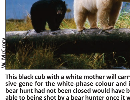
This black cub with a white mother will carry her recessive gene for the white-phase colour and if the black bear hunt had not been closed would have been vulnerable to being shot by a bear hunter once it was a grown black-phased bear.

For over 30 years VWS and our biologists have worked with many others including First Nations to stop trophy hunting of grizzly bears in BC. Thanks to the work of many and the overwhelming support from the residents of BC including many First Nations, in 2017 the BC government was finally forced to ban the hunting of grizzly bears except for First Nation's traditional uses. This still left open the trophy hunting of black bears. This is especially a concern on the BC central and north coast, where some black-phased black bears carry the recessive