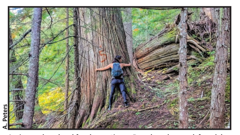
Ancient cedars slated for clearcutting at Russel creek were deferred, but with some "deferred" forest getting logged, there was no guarantee they would be left standing. They were the only big-tree remnants in a valley that had been heavily clearcut, and clearcutting had gone up to the boundaries of the old-growth. Local activists are keeping watch to ensure the deferred area remains unlogged, but in other areas logging is going unnoticed.

reduction in the Allowable Annual Cut, a dissolution of the trade deals made with foreign countries to ship our old growth overseas, and permanent protection of our remaining old growth forests, including through the creation of new major parks, especially needed for the carbon sequestration critically necessary to mitigate climate change.