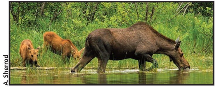
Moose are just one of many species that utilize the wetlands along Highway 31A that would be heavily impacted by Zincton Resort. Unfortunately, one of these calves was killed by a truck on Highway 31A. A massive increase in traffic would be detrimental to wildlife populations.

Like with Jumbo Valley, the threat of a mega-resort to the wild species and ecosystems we still have here cannot be mitigated, nor can the climate impacts, regardless of promises of a "green" development. BC people must rise up and say NO! to Zincton Mountain Resort, to leave behind the more important legacy of biodiversity for the next generation.