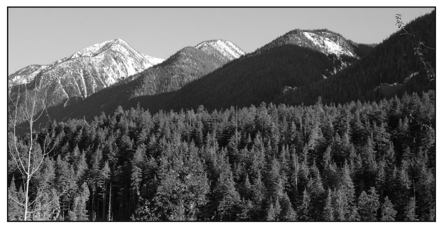
This old-growth cedar-hemlock forest along Fitzstubbs Creek was in the proposed Selkirk Mountain Caribou Park. It has now received partial protection as caribou Ungulate Winter Range (UWR).

Proposal. The new park proposal is smaller. Some of the area designated by government as Ungulate Winter Range should be upgraded to park status. The proposal contains three rivers paramount to ecosystem stability: the Duncan, the Incomappleux and the Lardeau. These have been heavily clearcut, but they support fragile populations of threatened bull trout, Gerrard Rainbow, and Kokanee salmon. The remaining old-growth is critical to protect fish, grizzly bears and a population of 90 mountain caribou.