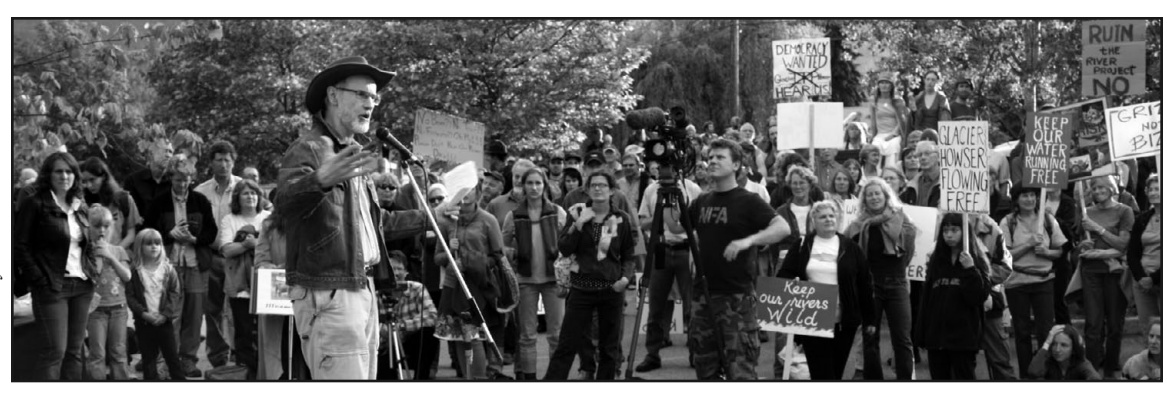
NDP MP Alex Atamanenko speaks to a crowd of over 1,000 protesters at a hearing of the Environmental Assessment process for the Glacier-Howser private power project. NDP MLA Michelle Mungall (far left) spoke forcefully against the project.

The proposed Bute Inlet independent power project (IPP) on the coast is being justified as a producer of "green energy." Yet it includes diversion of 17 streams, 445 kilometres of transmission lines, 314 kilometres of roads, 142 new bridges, 16 power houses and a substation — all in a coastal