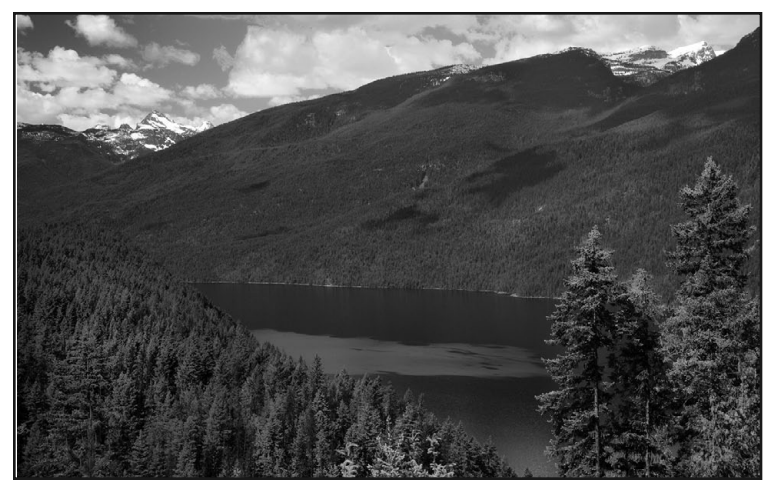
Across the lake, a large parcel of forest in the middle of the photo, along the lakeshore, is the Valhalla Mile. Now it is protected forever.

The Society is not set up to hold private land or to raise funds for private land acquisition. However, several years ago, some Valhalla directors set up a separate organization, the Valhalla Foundation for Ecology and Social Justice (VF),