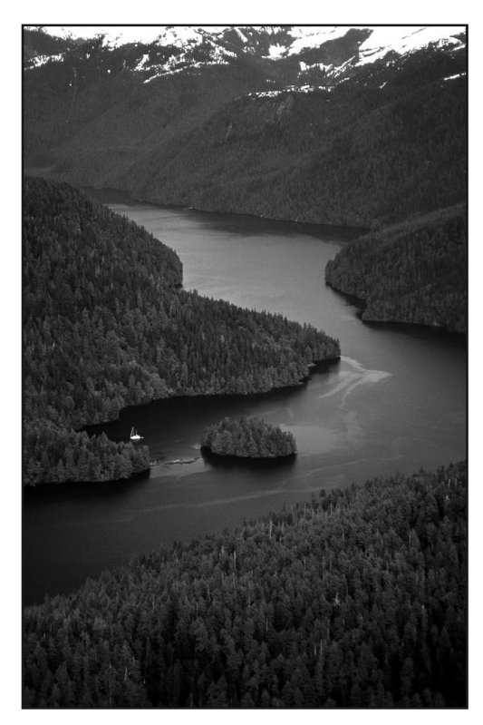
The Green Inlet has had some light logging since the Great Bear Rainforest decision, but it remains mostly pristine, a priceless and irreplaceable gem in BC's coastal ecosystems.

The government's 2006 Great Bear Rainforest decision protected 80% of the Society's Spirit Bear Conservancy proposal, but it failed to protect several key areas of ecological or genetic significance for the survival of spirit bears. So today the Society is working on two new conservancies on the coast. One of them, the 23,777-hectare Green inlet/river valley provides a rich and hidden marine ecosystem where grizzly and spirit bears feast on Pacific salmon spawning amidst towering stands of giant Sitka spruce.